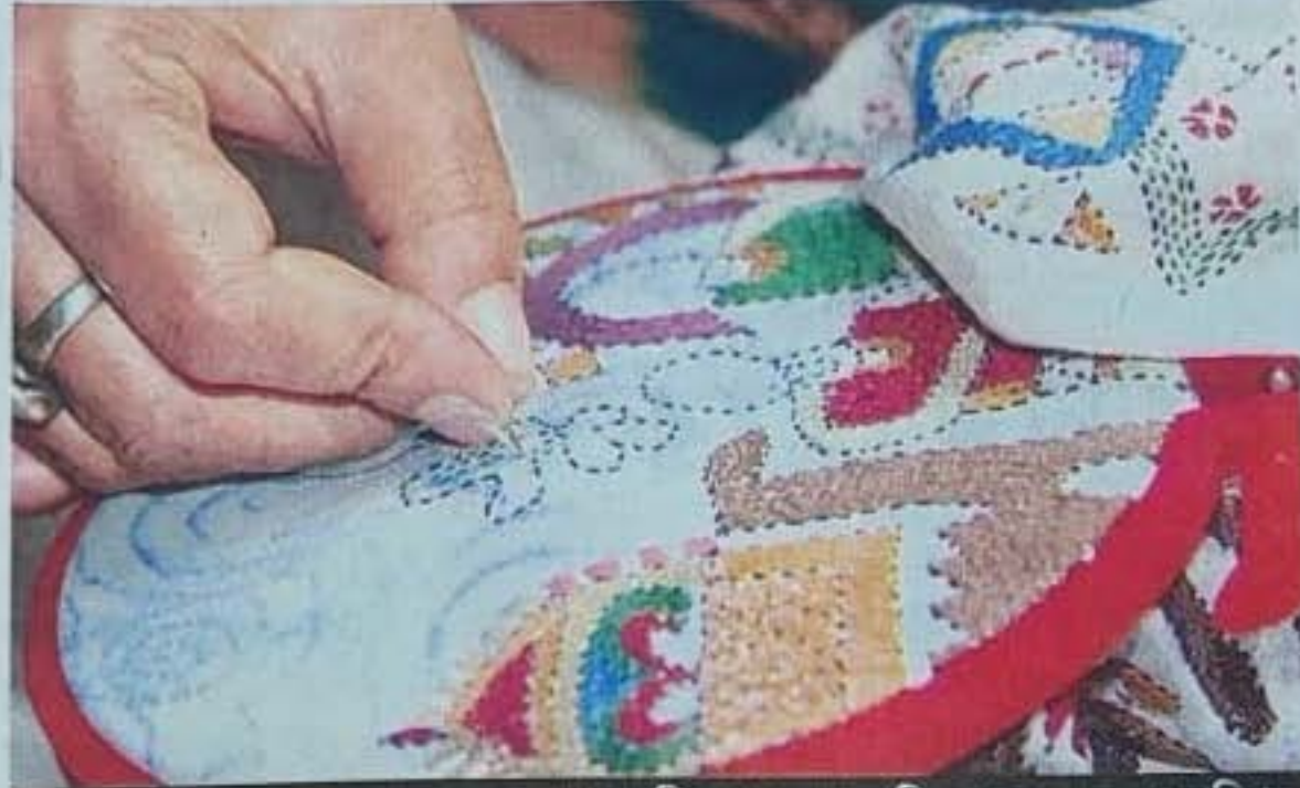
কাপড়ের উপর সুতোর কাজ চলছে। (ডানদিকে) এমব্রয়ডারির কাজ করছেন কারিগর